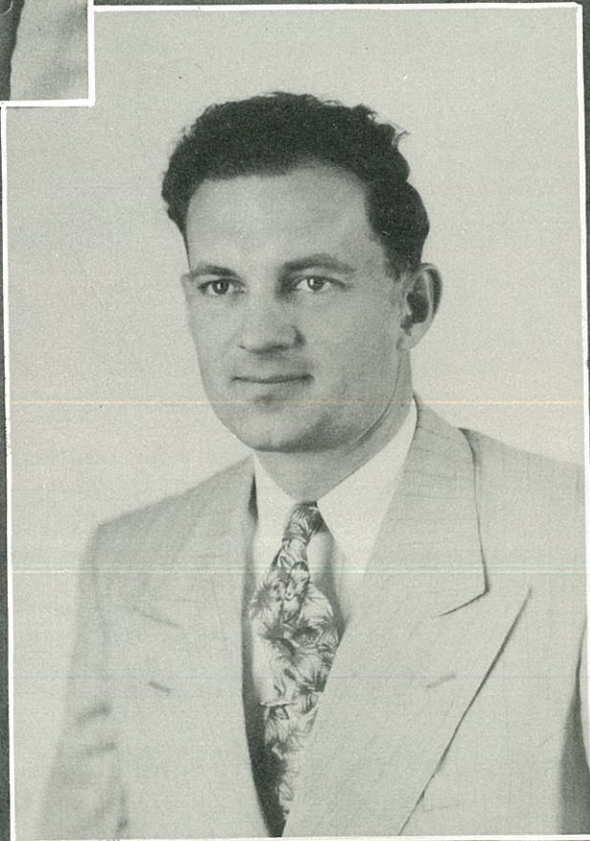
Oliver J. Bierschwale Elementary Principi

Education of today is concerned more with boys and girls than it is with books. We are not satisfied with teaching mere subject matter but are interested, as well, in the development of the whole personality. It is my belief that Wink High School has developed a program of education which is rich in tradition, modern in methods, and distinctive in its quality. Therefore, we challenge you students that when you have completed what you thought you couldn't, attack another impossibility.